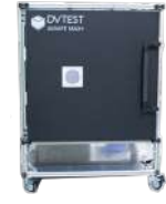
dbSAFE MAX X